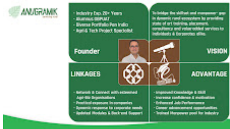
ANUGRAMIK Brochure JPEG..jpg 156K