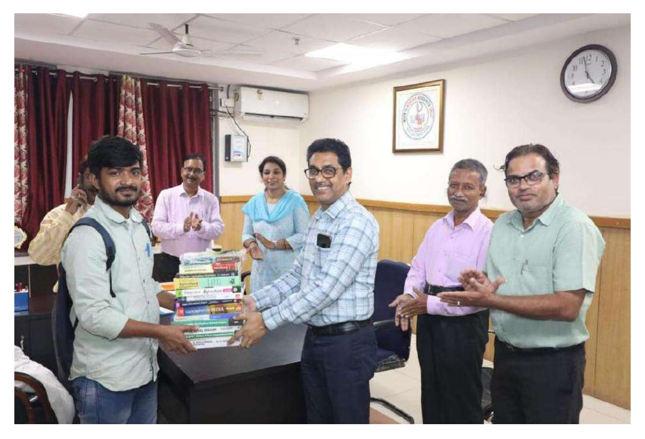
Distribution of books to the students